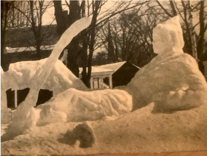
A snow sculpture on the Dartmouth College campus, circa 1941.